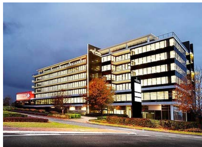
Healthy tenants ... at Norwest Business Park, Atlas Norwest will strengthen its position as a development with the opening of a Virgin Active Health Club.

NORWEST Business Park is expanding to accommodate growth in the North Ryde and Macquarie Park region.