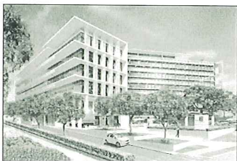
One of the new buildings at Norwest.